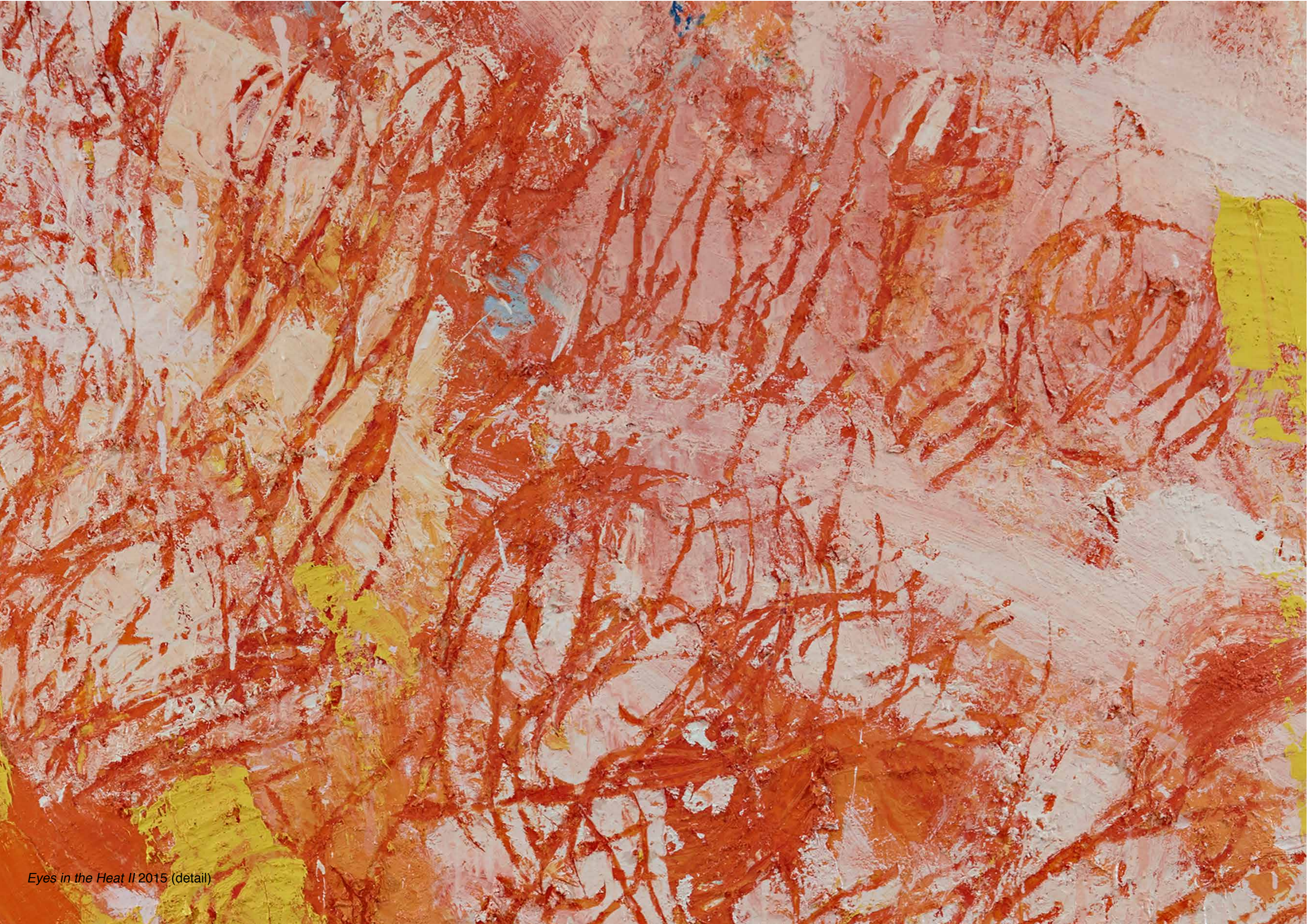
Eyes in the Heat II 2015 (detail)