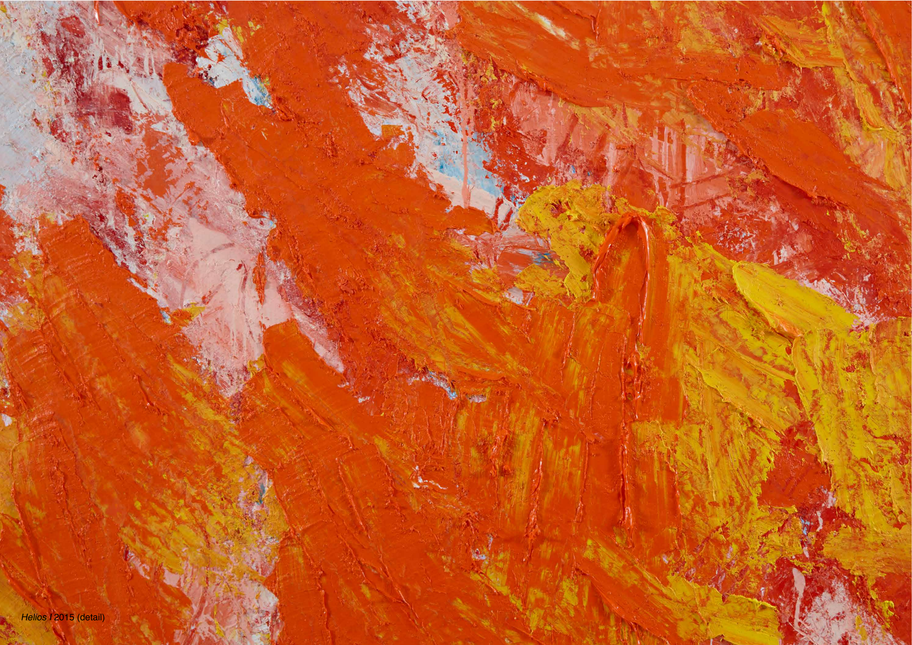
Helios I 2015 (detail)