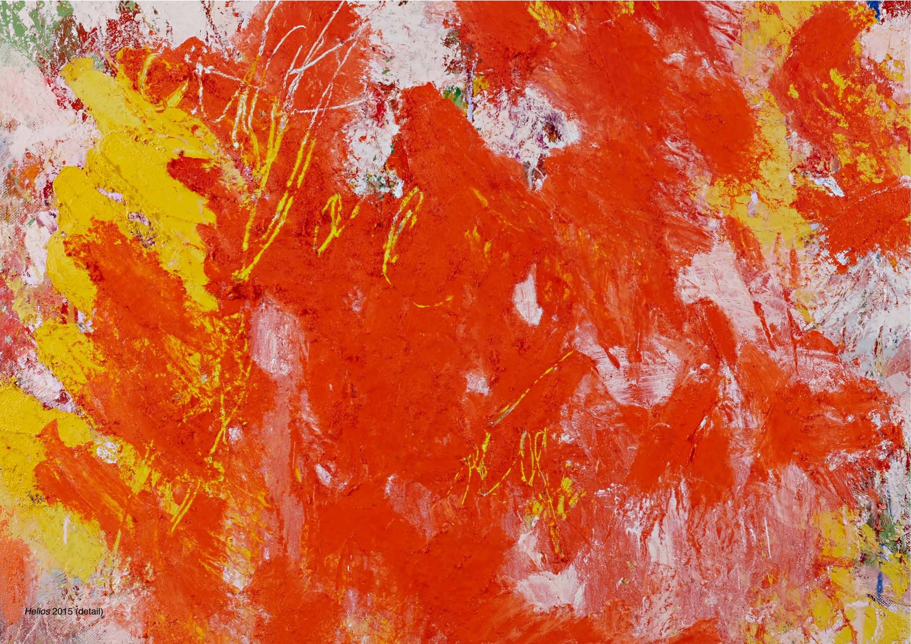
Helios 2015 (detail)