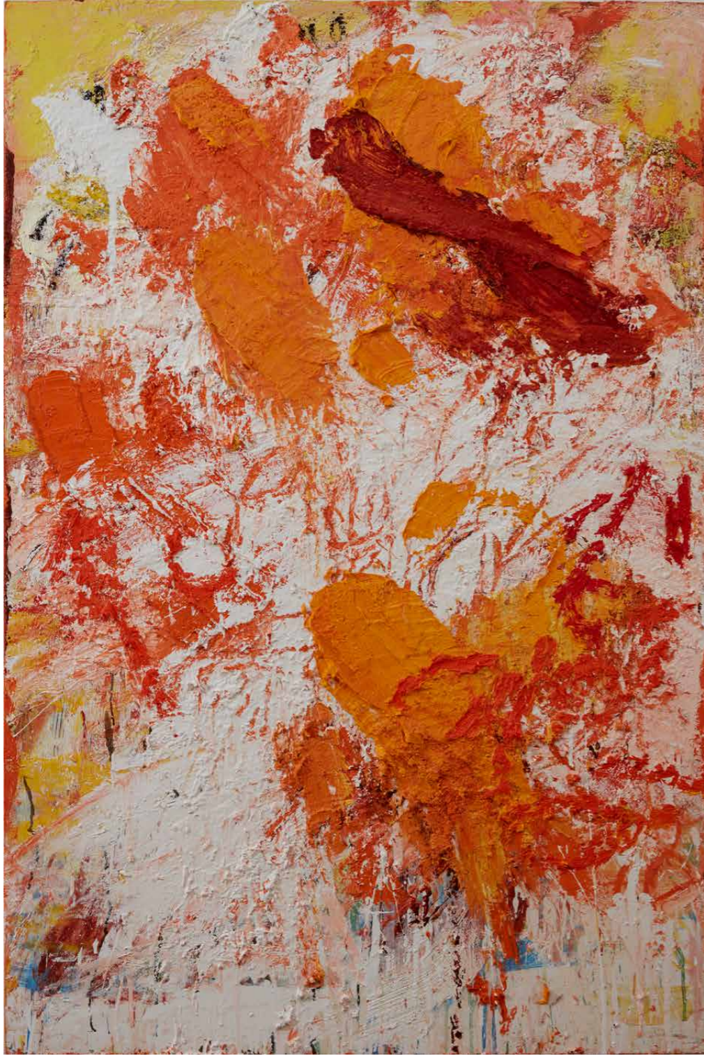
Firebird I 2015 oil on wood 120 x 80 cm