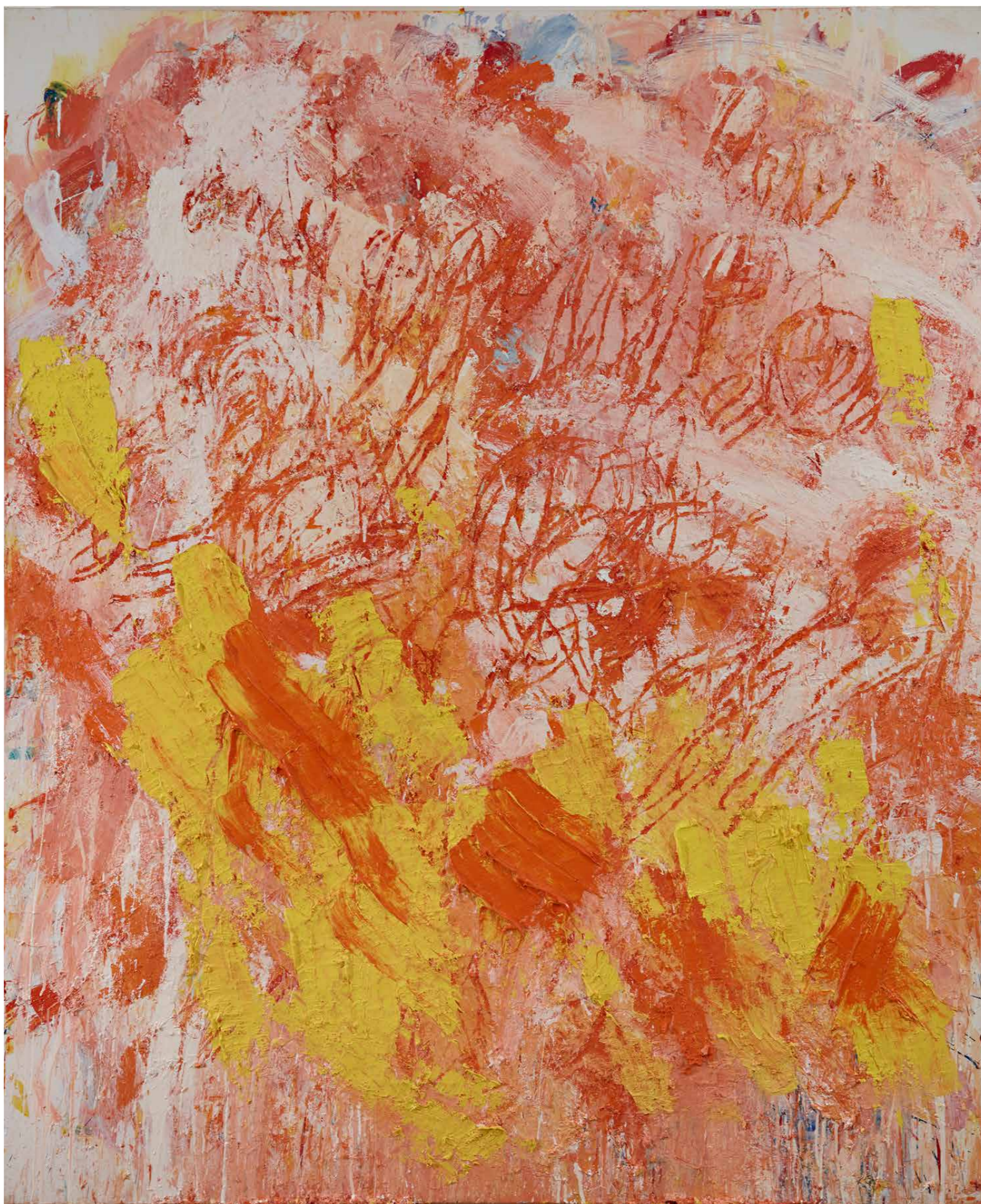
Eyes in the Heat II 2015 oil on canvas 183 x 153 cm