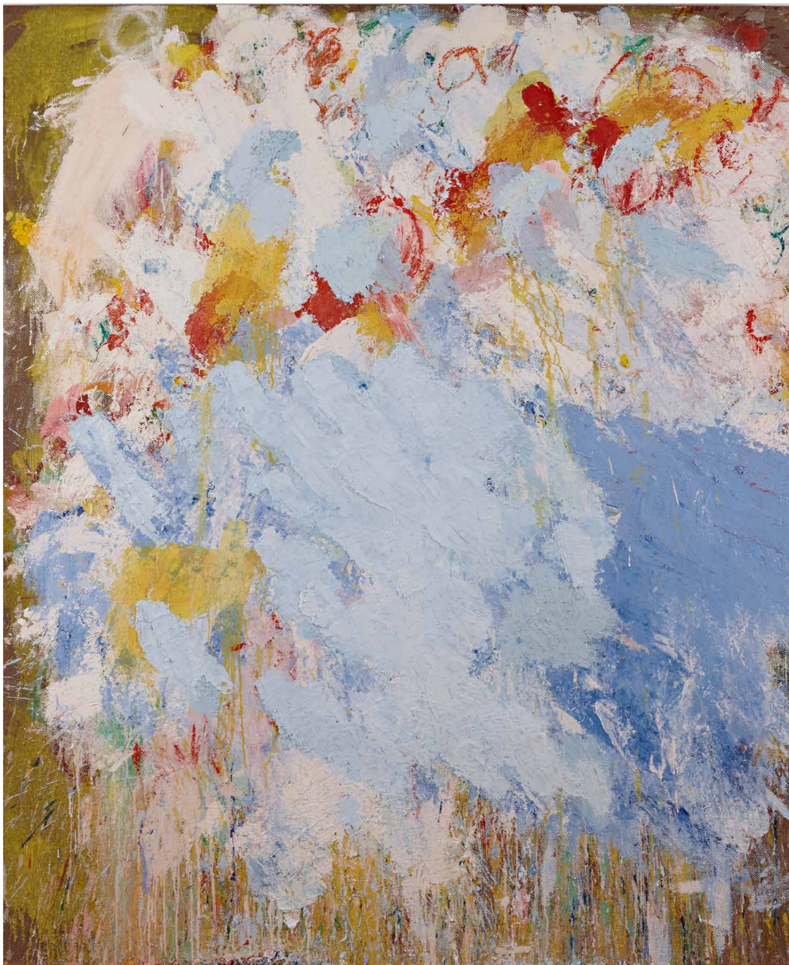
Bribie 2015 oil on Belgian linen 183 x 153 cm