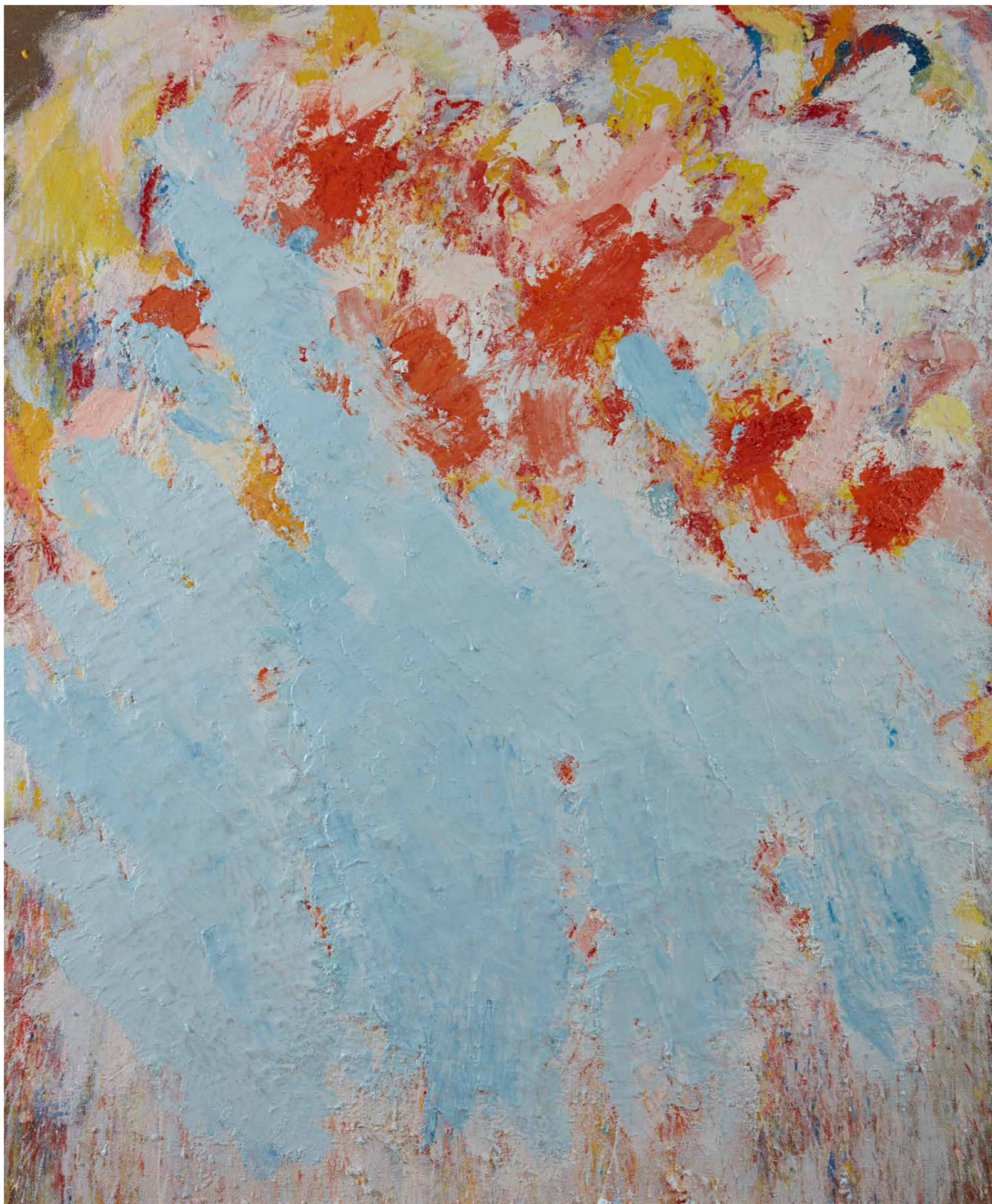
Bribie I 2015 oil on Belgian linen 183 x 153 cm