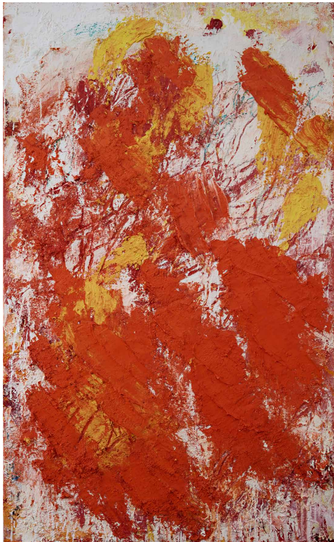
Liquid Amber 2015 oil on canvas 138 x 84 cm