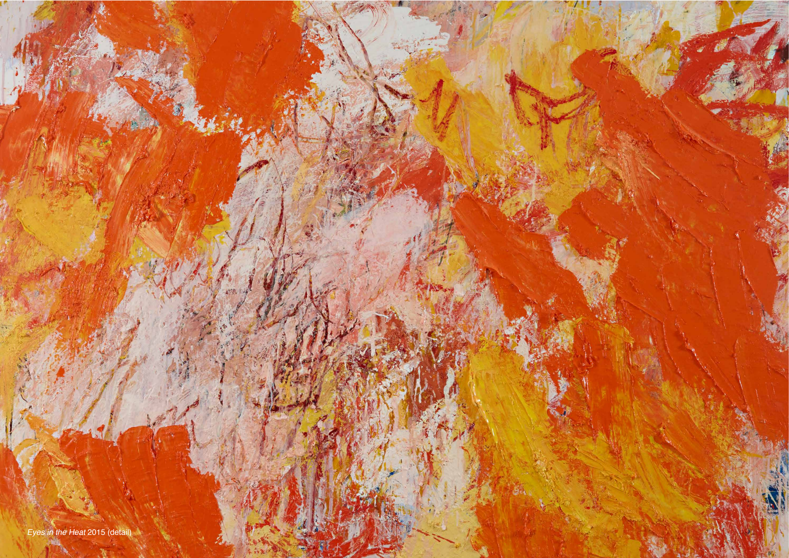
Eyes in the Heat 2015 (detail)