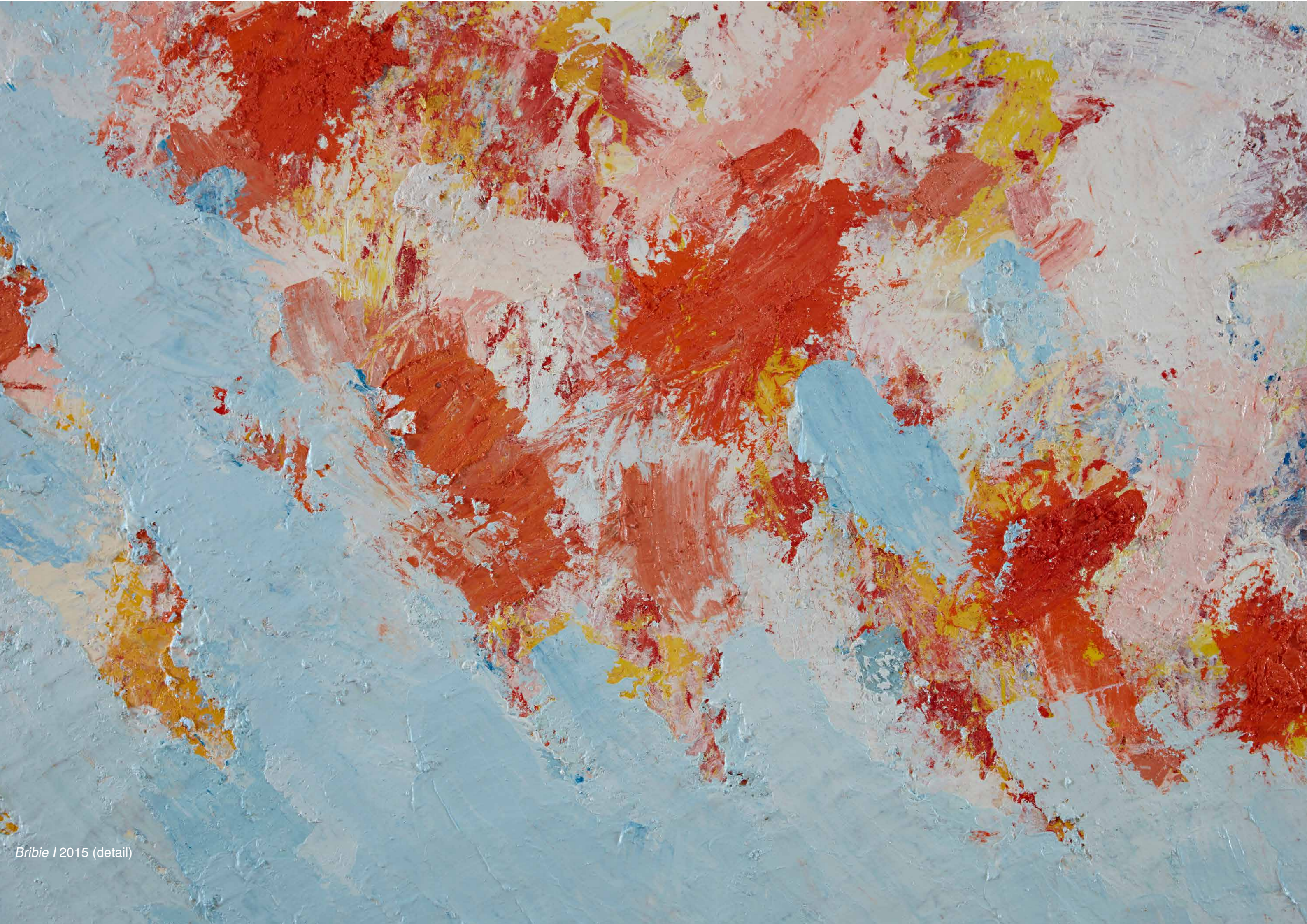
Bribie I 2015 (detail)