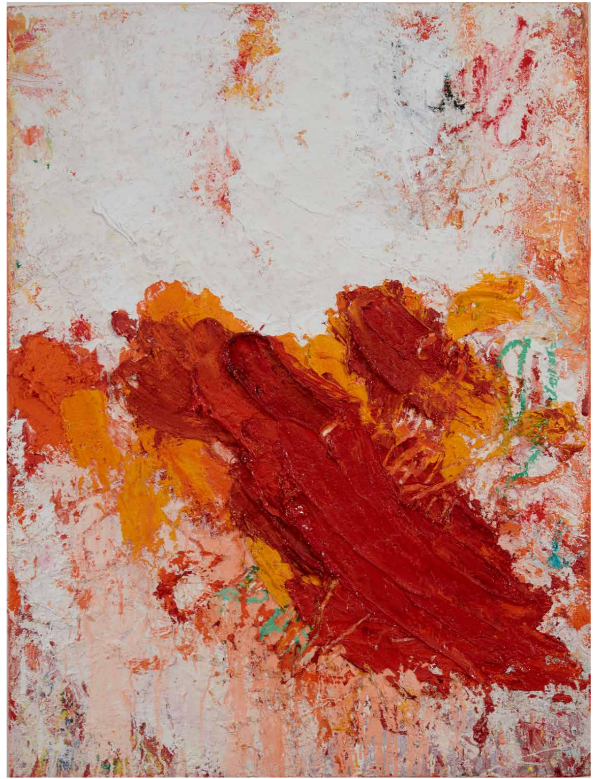
Heartland I 2015 oil on canvas 102 x 76.5 cm