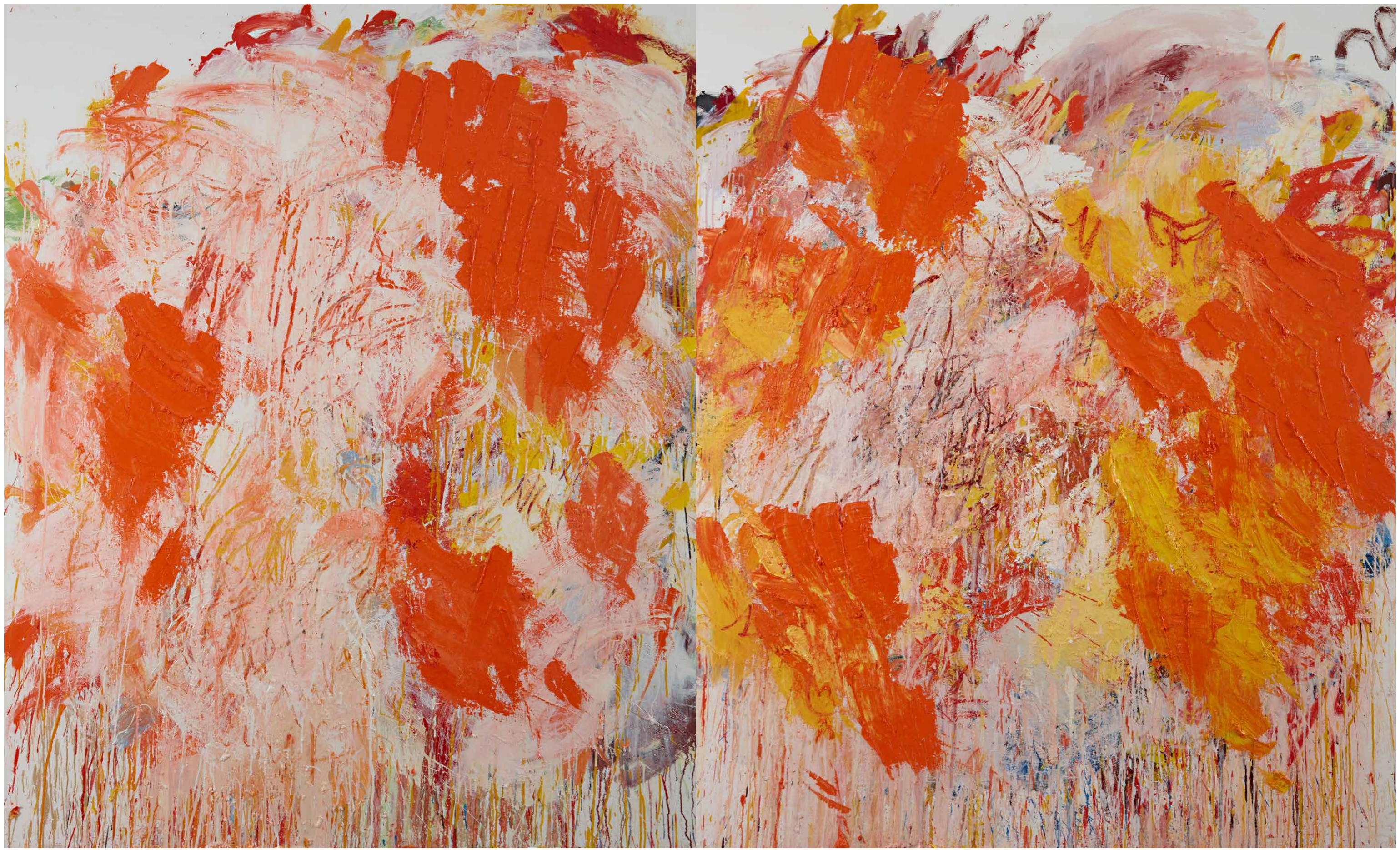
Eyes in the Heat 2015 oil on canvas 183 x 306 cm (overall size)