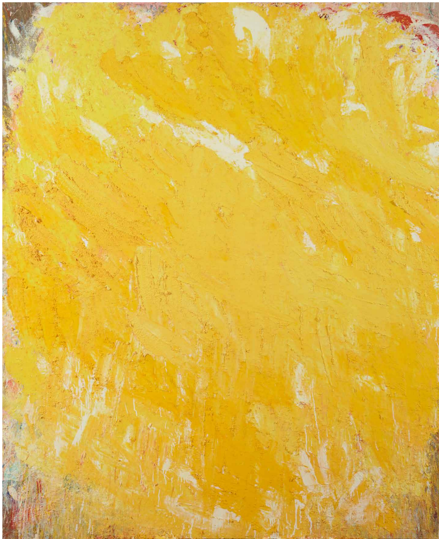
Gloria 2014 oil on Belgian linen 184 x 154 cm