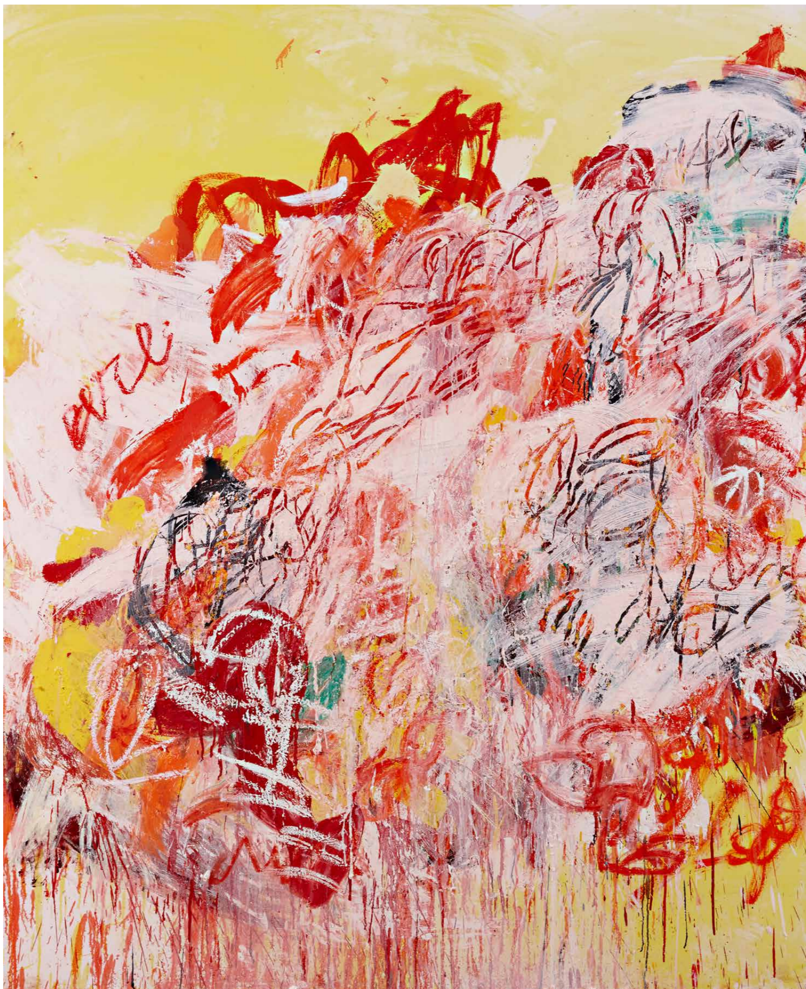
Eyes in the Heat I 2015 oil and oil crayon on canvas 183 x 153 cm