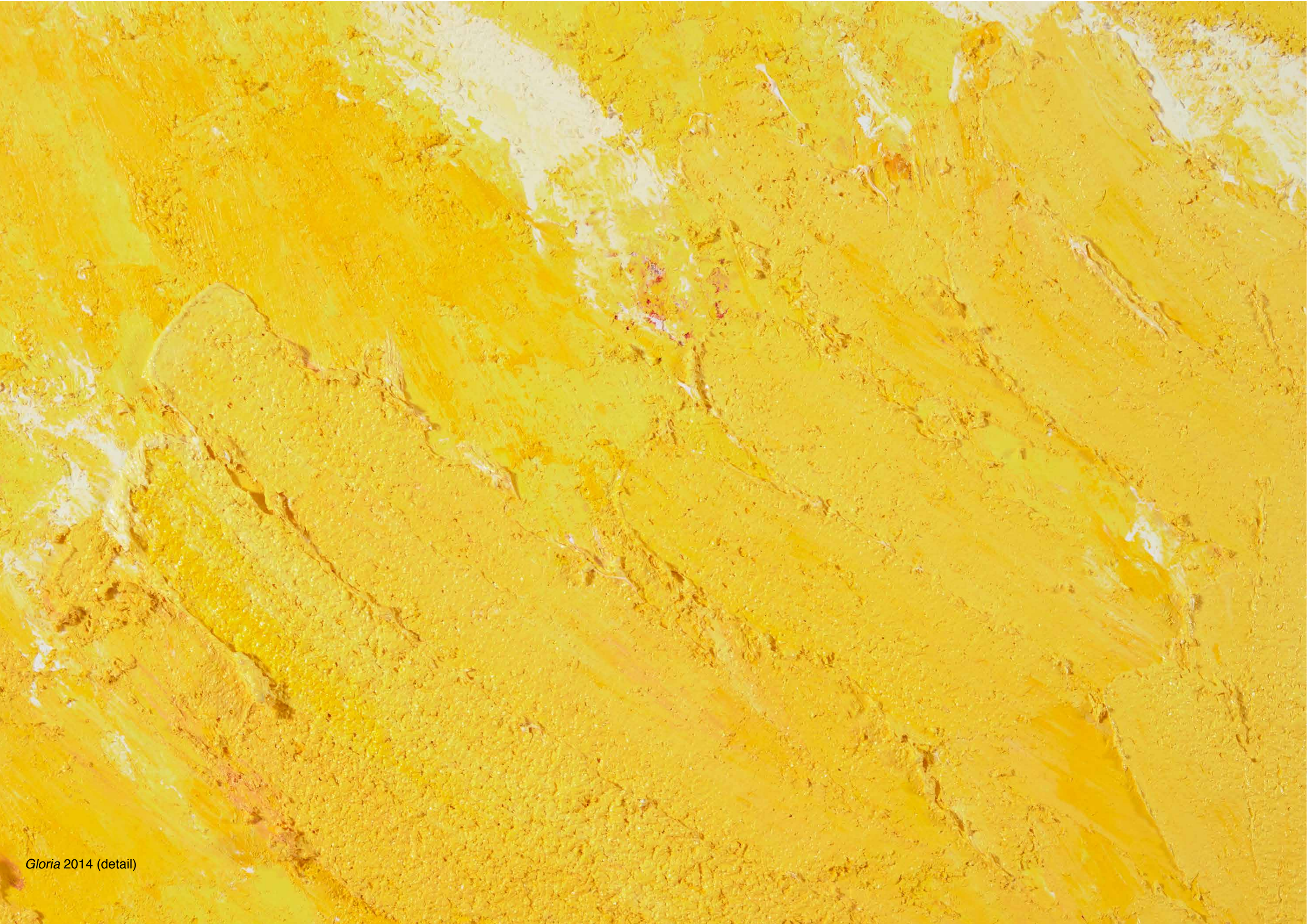
Gloria 2014 (detail)