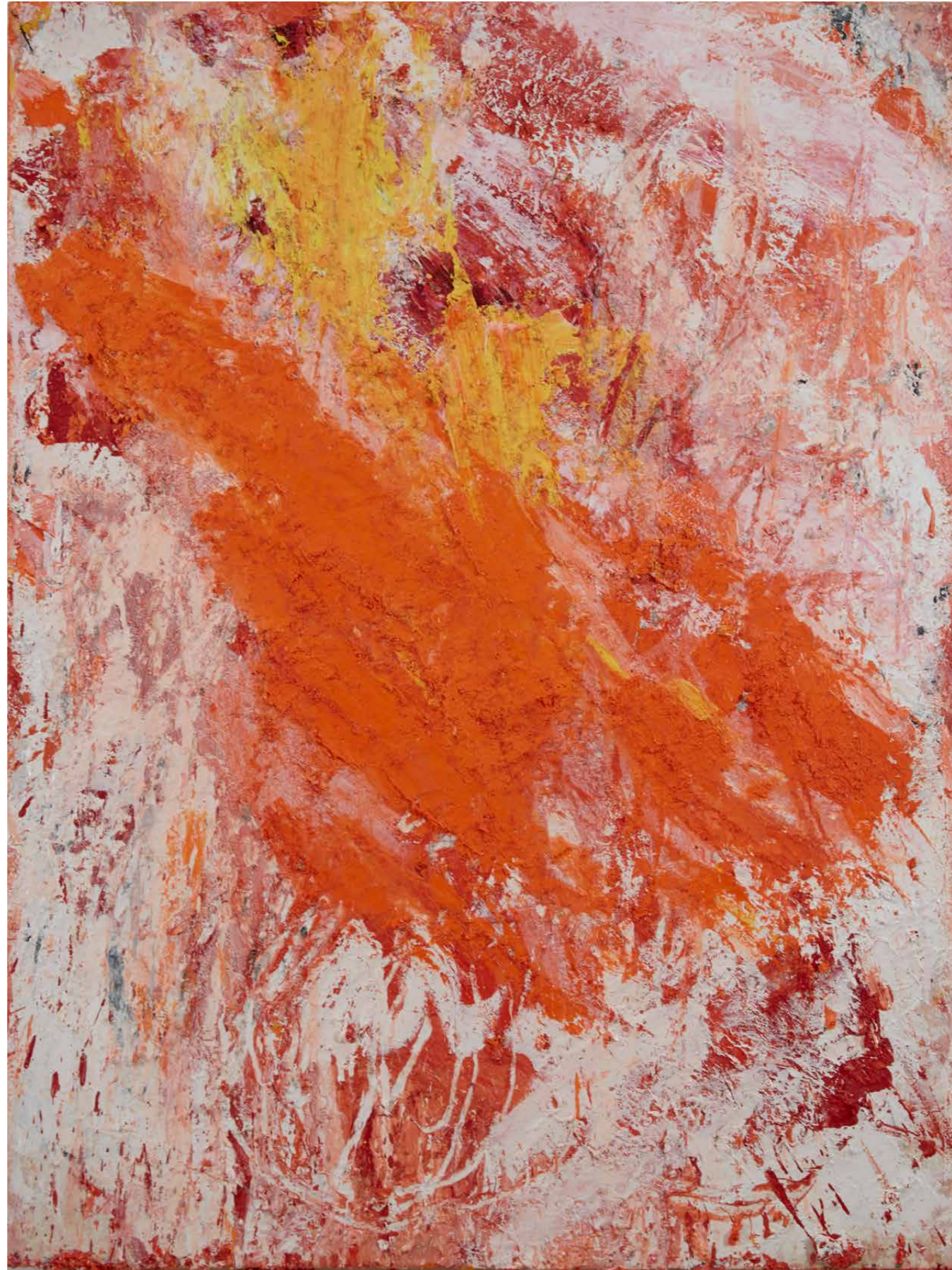
Heartland 2015 oil on canvas 102 x 76 cm