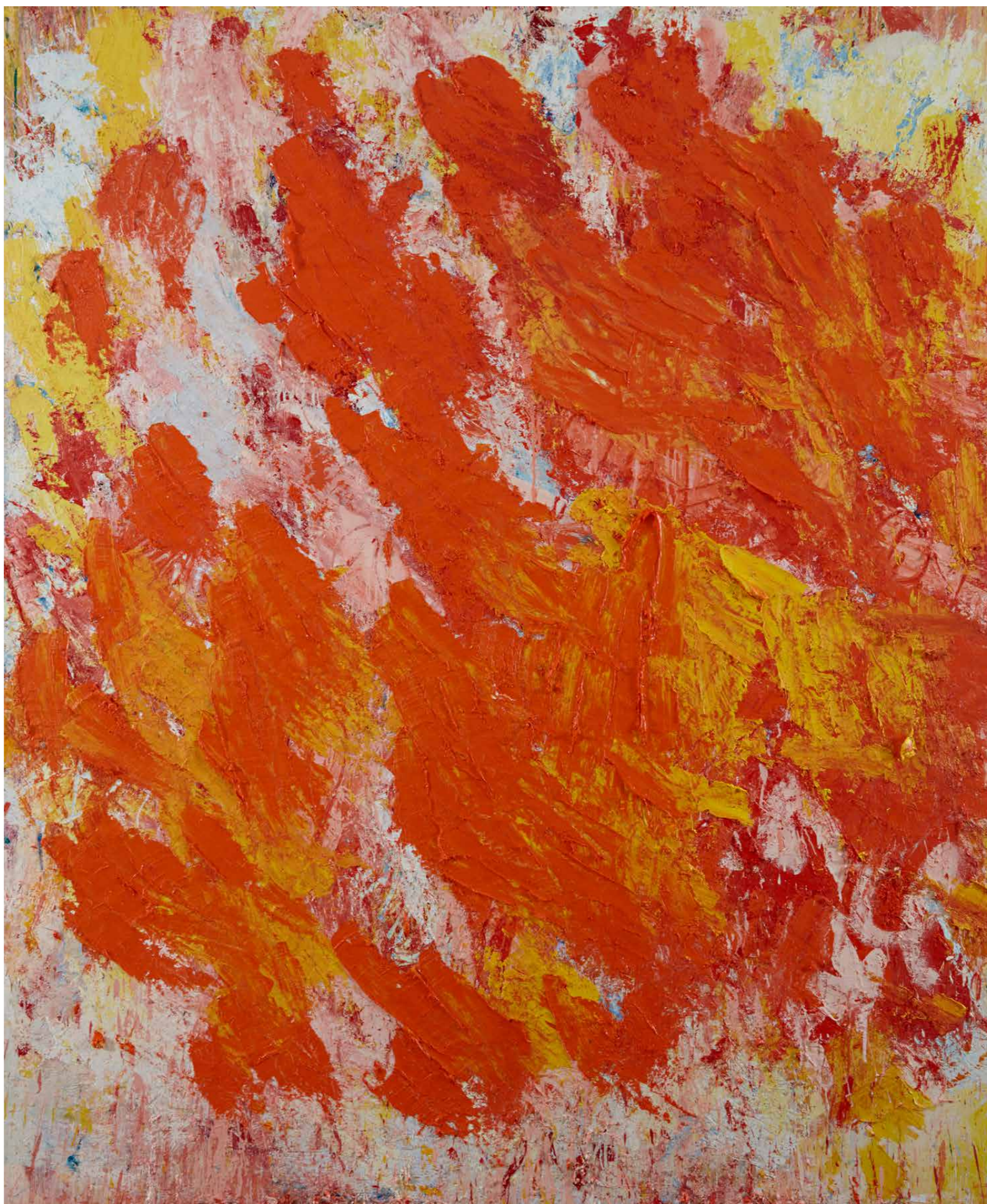
Helios I 2015 oil on Belgian linen 183 x 153 cm