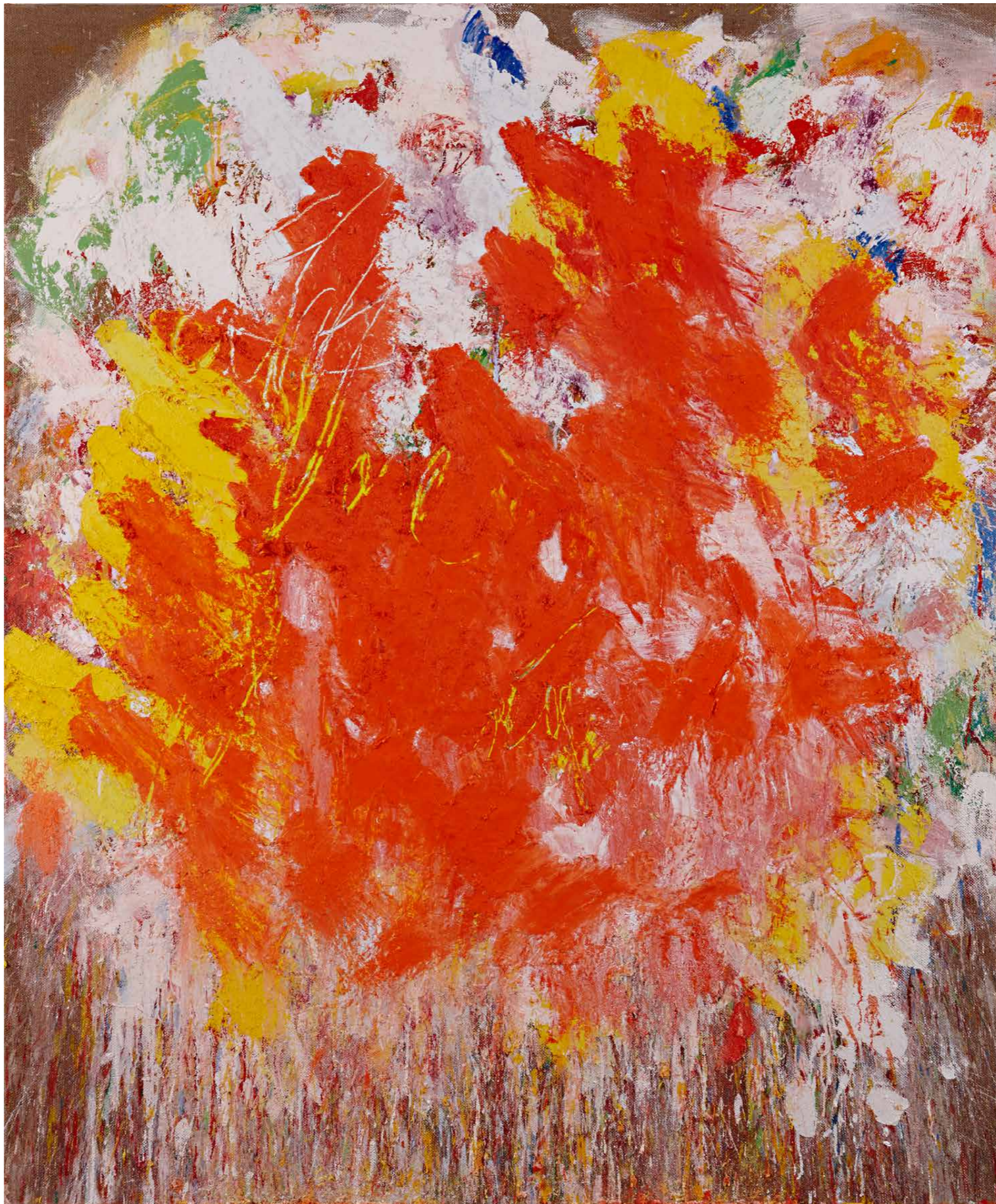
Helios 2015 oil on Belgian linen 183 x 153 cm