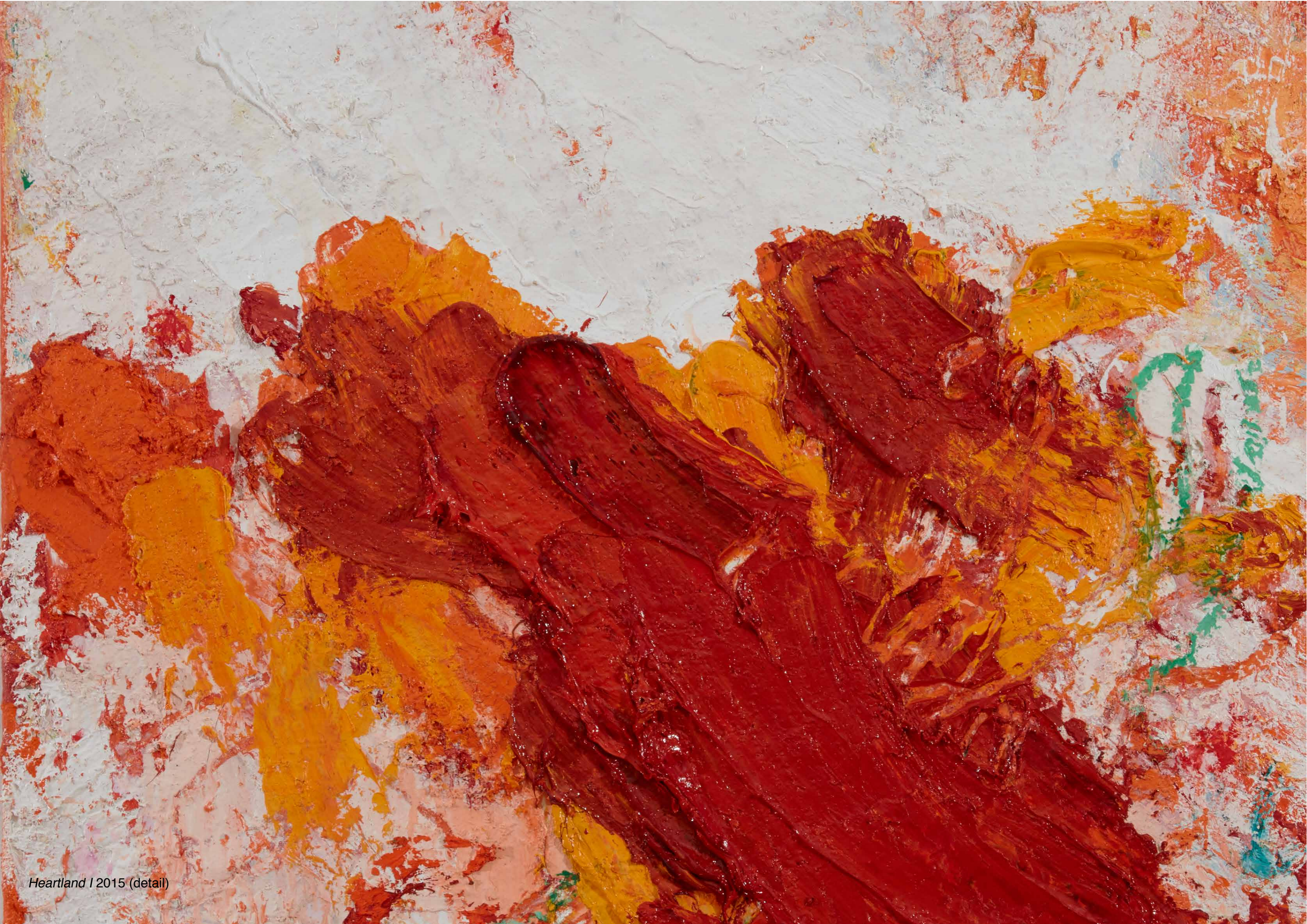
Heartland I 2015 (detail)