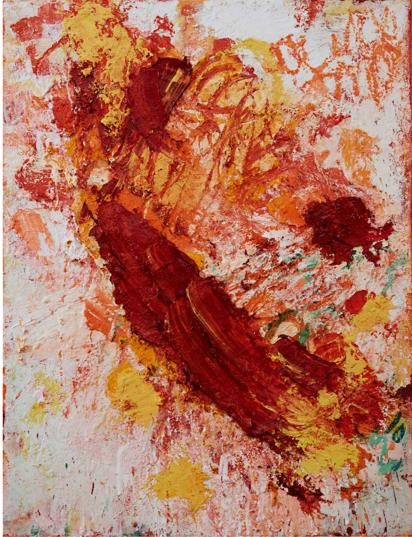
Heartland II 2015 oil on canvas 101.5 x 76 cm