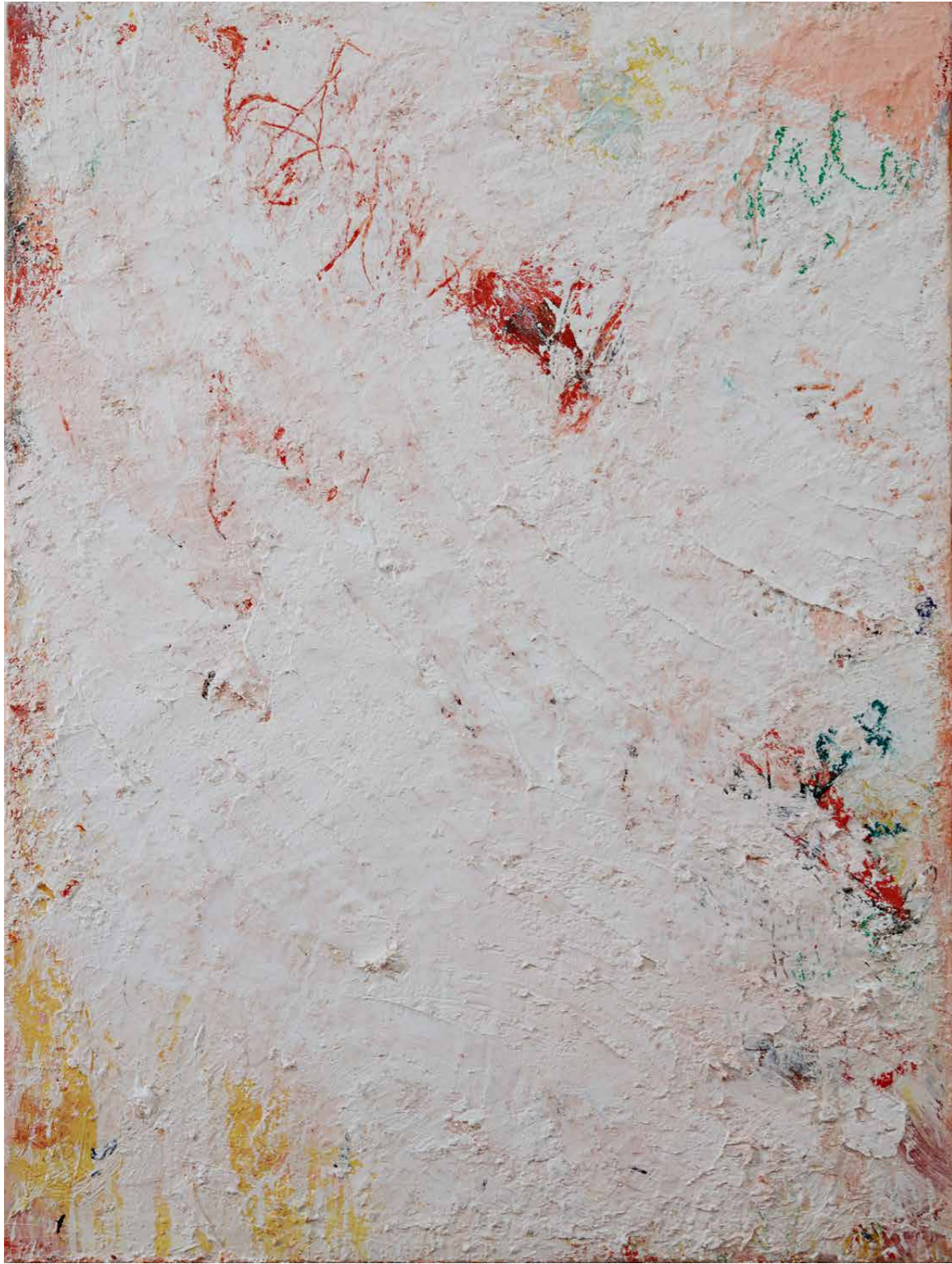
Ash 2015 oil on canvas 102 x 76 cm